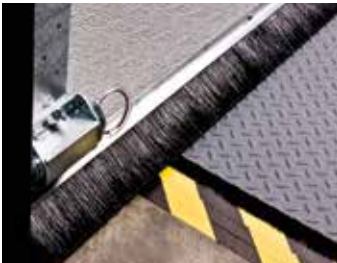
Bottom Brush Seal In addition to bottom loop seal for maximum perimeter seal.