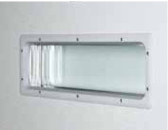
Thermal Pane Rectangular Window Provides visibility outside the cold storage facility for cold storage environments.