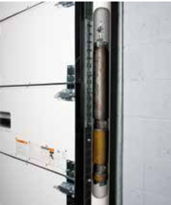
E-Lift CounterWeight Adjustable system eliminates the need for counterbalance springs.