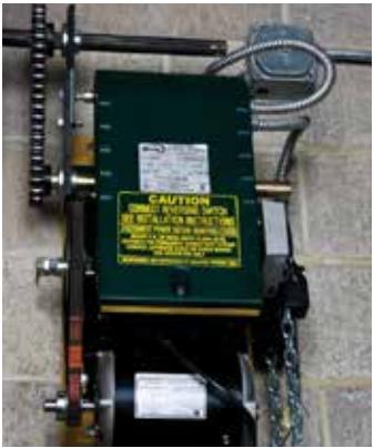
Motor Operator Built with convenience in mind, operators include a floor level chain hoist to ease manual operation in an emergency or power outage.